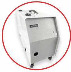
Wire Feed Unit